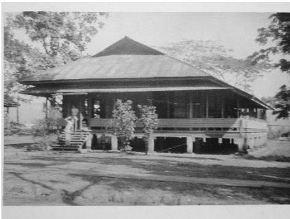
Fifth Bomber Command