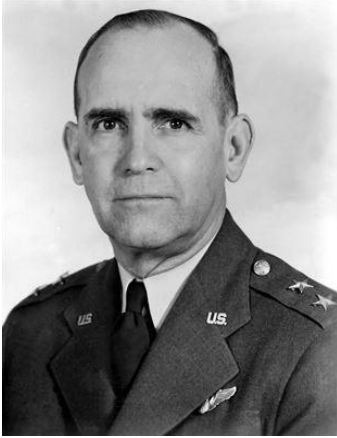
General Jarred V. Crabb

Flights were made to Southeast Asia (later Vietnam) to get the correct type of cigars for the general, for example. "We were told by the general to go investigate the area for possible activity and 'did we know that not far from there were some pretty good cigars?' Of course, we had to go look!" Beer runs also occurred in a similar way.