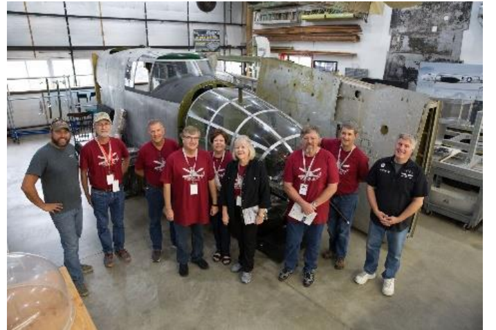
Visiting the Warbirds of Glory Museum