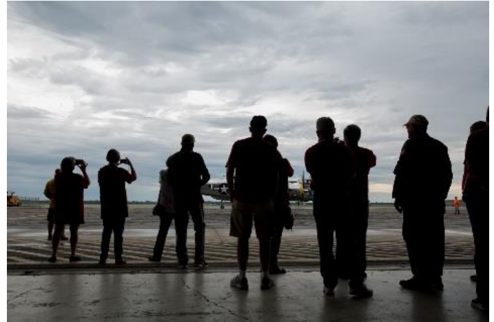
Taxiing at Willow Run